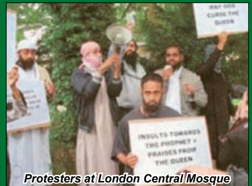
Protesters at London Central Mosque

"Democracy, hypocrisy," Choudary chanted as the crowd echoed him. "Tony Blair, terrorist! Tony Blair, murderer! Queen Elizabeth, go to hell!"