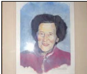
Above: Mary Todd Lincoln.

Left: Picture of Abraham Lincoln hanging in the Spiritualist Association in Great Britain. The newspaper article below claimed that he was a Spiritualist. This was probably untrue -- it was his wife.